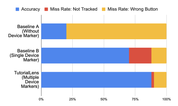
Figure 5: Accuracies and miss rates for the three approaches: (1) Baseline A (without device marker), (2) Baseline B (single device marker), and (3) TutorialLens (multiple device markers). Two types of errors occurred: (1) no device marker available thus finger is not tracked, and (2) AR visual guidance appearing on the wrong button. Note that error type (1) does not apply to Baseline A, as it does not use device markers.

using OpenCV [4], hand detection using OpenPose [5] and MediaPipe [23], or transfer learning on top of trained object detection models. However, these methods had critical drawbacks that made them not ideal for our use case, including (1) only providing 2D coordinates by processing the 2D camera view; (2) requiring the entire hand to be in the camera view to detect the finger junctions; (3) relying heavily on colors or shapes of fingers and having lots of false positives.